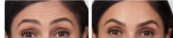
Before After (Day 7)