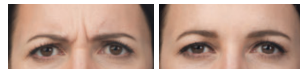
Before After (Day 7)